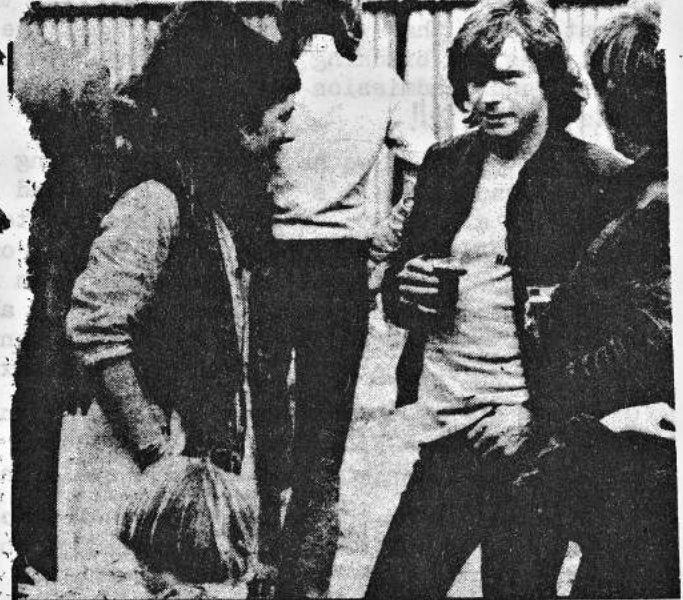
DAVE EDMUNDS meets the people (wow!)

ADVANCE TICKETS £2.00 ON SALE TONIGHT, FROM BUBBLES STALL